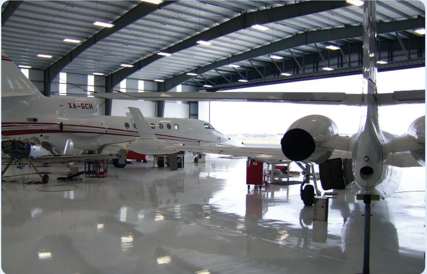
The interior of the new Southstar Aircraft Interiors hangar

Adequate space for planes was high on the list of requirements. Radicke said that the goal was to hold two Gulfstream-size planes with five Citation-size planes around them. The span of the building and door height make it the standout at Garner Field. It's the largest single-span hangar that Lansford has ever built. "There's nothing cookie-cutter about this building," Lansford laughed. "This building is a marriage of Southstar's needs, their growth expectations for the next 30 years and the type of aircraft that they target for their business," he added.