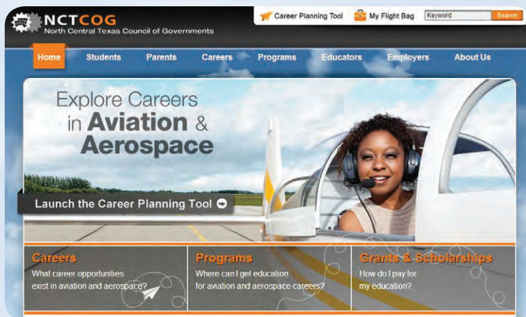
A screenshot of the NCTCOG aviation careers website

The website, www.nctaviationcareers.com , was developed to show students a path to a successful career in aviation. An interactive career planning tool allows students to quickly explore information such as job descriptions, salary, projected job growth and educational requirements. The goal is to make it as easy as possible for students to discover which aspects of aviation interest them and options for pursuing education needed in those careers.