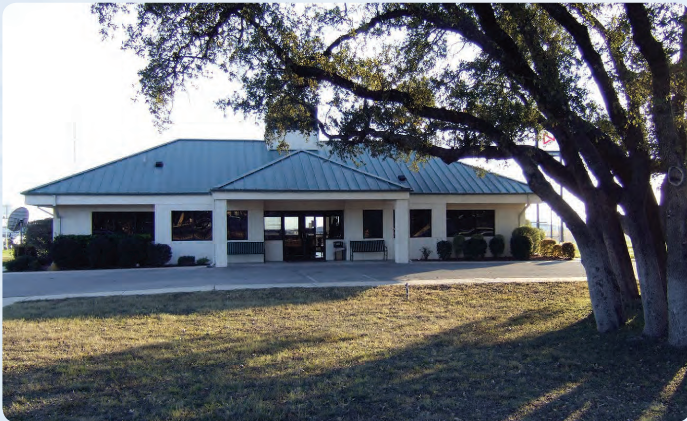
The terminal building at Garner Field in Uvalde