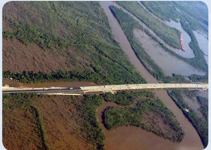
View of Interstate 10 west to east at the Texas Travel Information Center (the Texas Welcome Center) in Orange, Texas.

At the CAP's request, the FAA imposed a temporary flight restriction for a portion of the recovery period. The TFR included unmanned aircraft in the flight prohibitions.