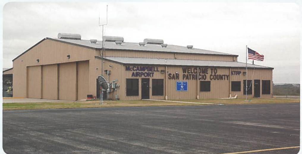
The new terminal building at McCampbell Airport.

Located two miles north of Ingleside, TP McCampbell (KTFP) is one of the two airports owned by San Patricio County. Because of its prime location nestled between Port Aransas and Corpus Christi, it's easy to see why local Jim Price, the