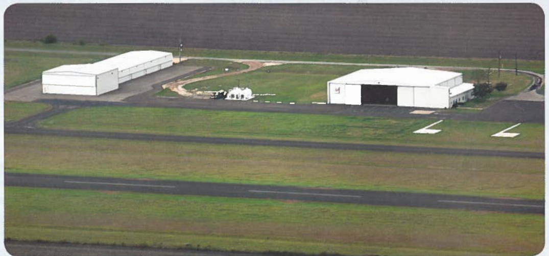
An aerial view of the terminal building and hangars at the Calhoun County Airport.