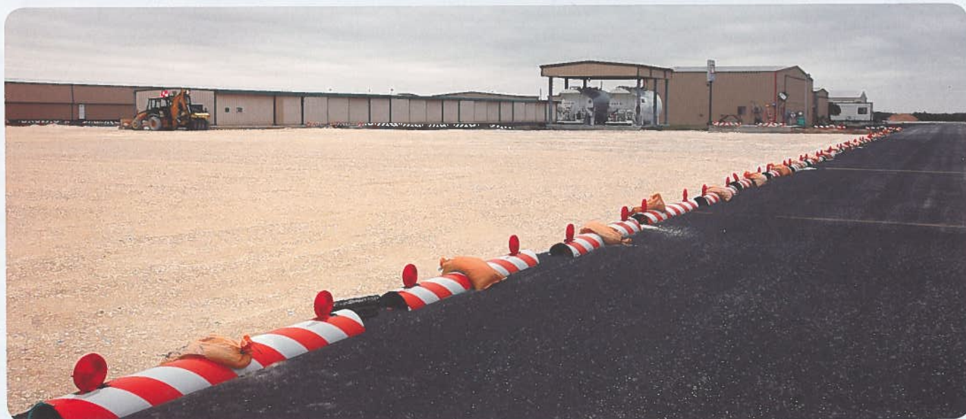
The expanded tarmac, which is currently under construction, will allow more room for jets and heavier aircraft at McCampbell Airport.

For more information on TP McCampbell Airport, please visit http://www.airnav.com/airport/KTFP . ♦