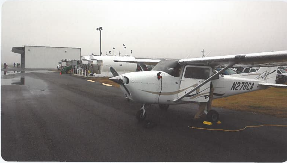
The new fueling facility, hangar improvements and Cessna 172AP Skyhawk used for training the next generation of flyers at the Calhoun Air Center are shown in the photo above.

Their efforts paid off by winning the "Most Improved Airport" award at TxDOT's aviation conference in 2009.